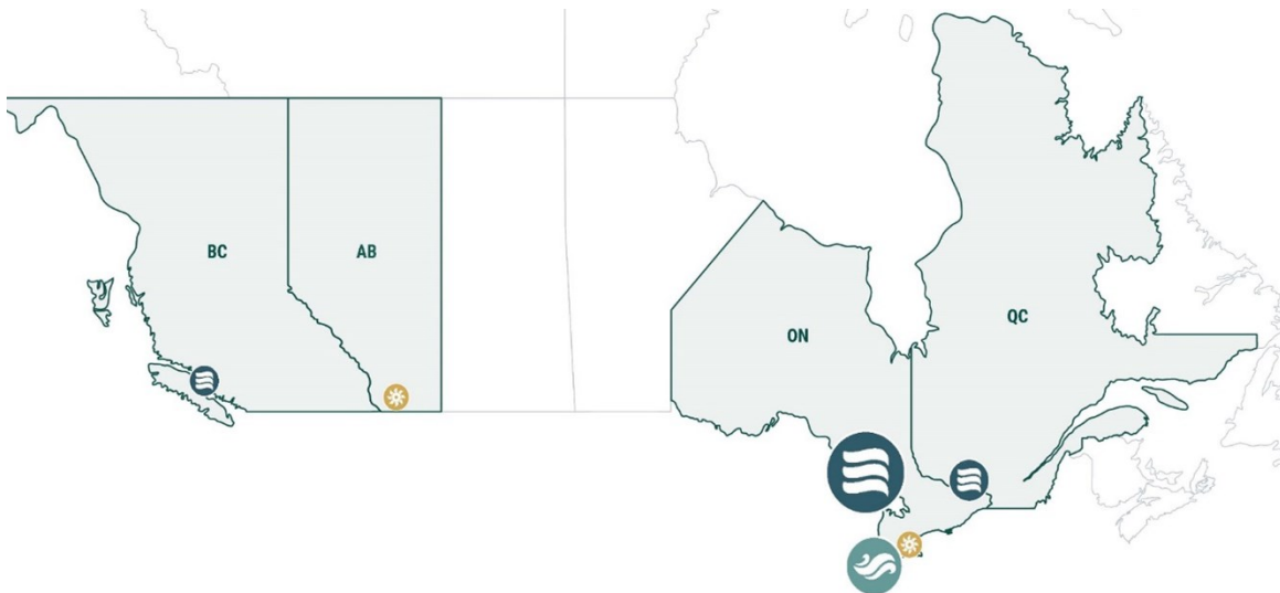
Evolugen's Canadian Presence

In Canada, Evolugen owns and operates 61 renewable energy facilities, including 33 hydroelectric facilities, 4 wind farms, and 24 solar sites, with a total installed capacity of 1,912 MW, located across British Columbia, Ontario and Quebec. Recently, Evolugen announced a new to-be-built ~40MW solar facility in Alberta. As a renewable energy industry leader, Evolugen provides sustainable solutions designed to accelerate the transition to a low-carbon future in Canada.