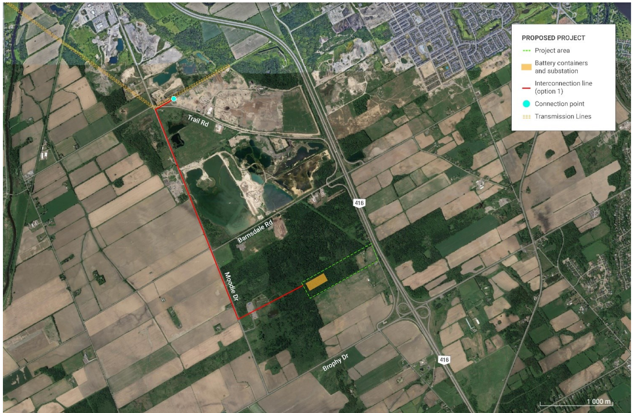
PRILIMINARY MAP of Trail Road BESS – NOT FINAL. We are exploring various paths of connection from the transmission lines to the BESS facility.