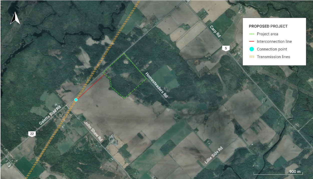
Map of Fitzroy BESS