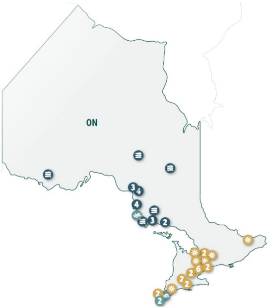
Evolugen's Ontario Presence

Our portfolio of facilities and our development expertise in hydro, wind, solar and storage enables us to accelerate Canada towards a low-carbon future by powering both its vibrant metropolitan areas and remote, close-knit communities.